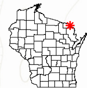
Project Location in Wisconsin